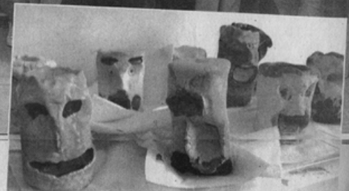
Balbo's Grade 7 class show off their newly acquired sculpting skills.